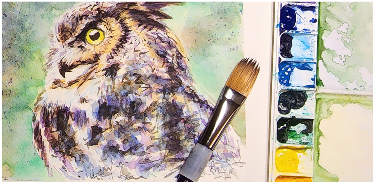
Watercolor Painting Class starts March 8

Tuition is $170 for non-members / $153 for current CAC members