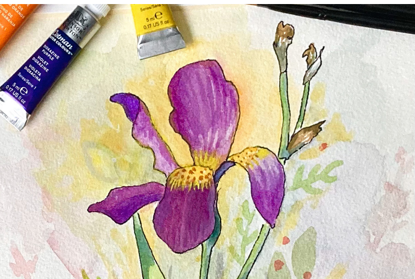
Exploring Watermedia II Workshop - March 23

Our classes provide a creative space for artists to learn at every age and level.