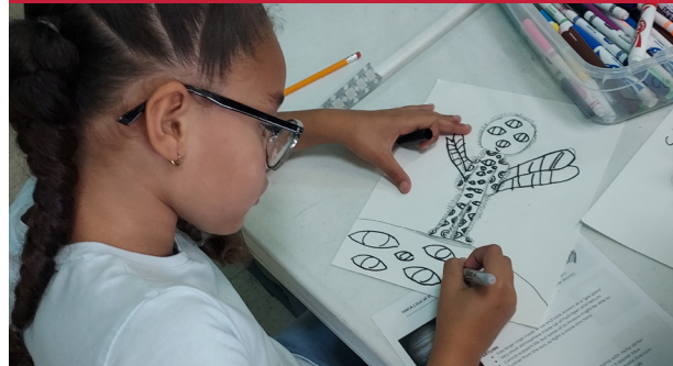
Young artist in the Portage YMCA after school art program