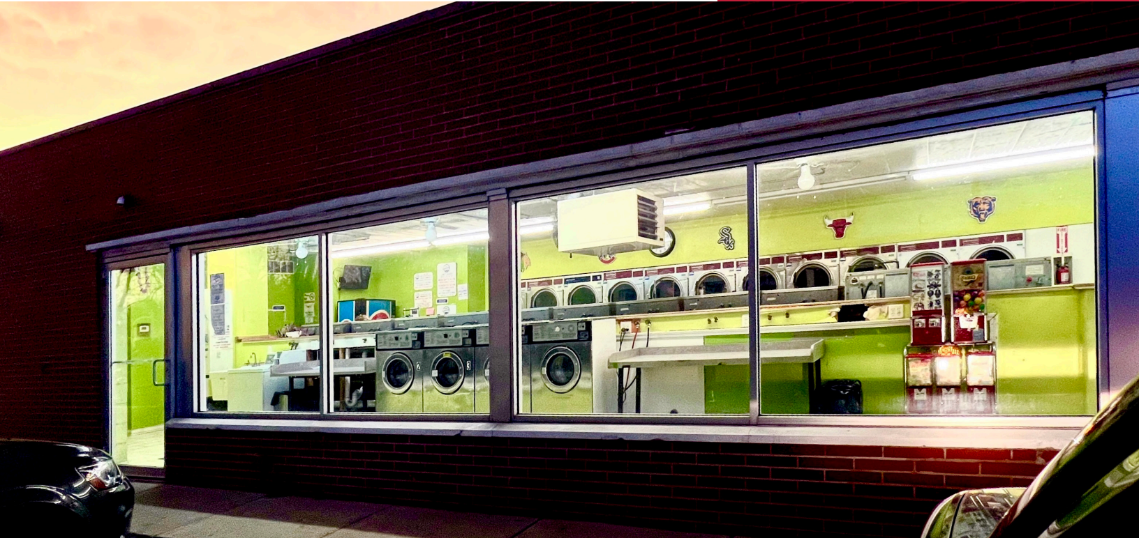
Gretchen Maguire, Rumble Dry , 2023