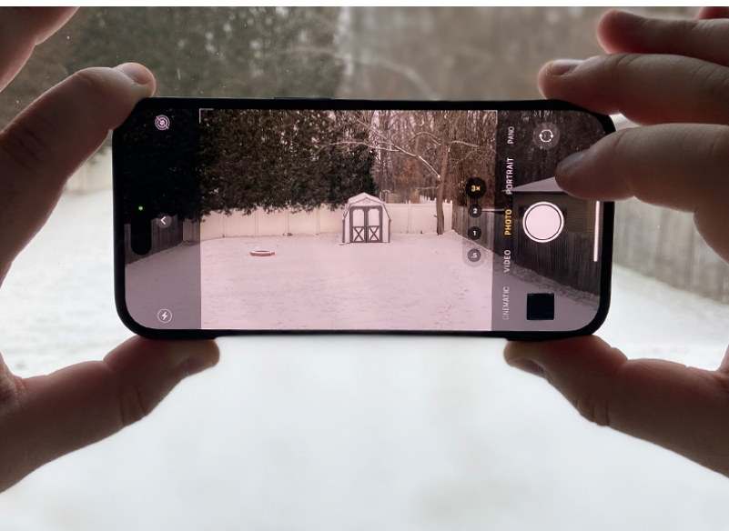
Cell Phone Photography Workshop - November 18

Register today at chestertonart.org/adult-classes-and-workshops