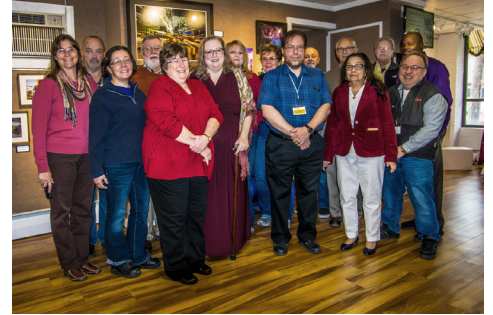
Pictured: Duneland Photography Club Members at the Chesterton Art Center in 2019 exhibition "Photo Memories in Focus"