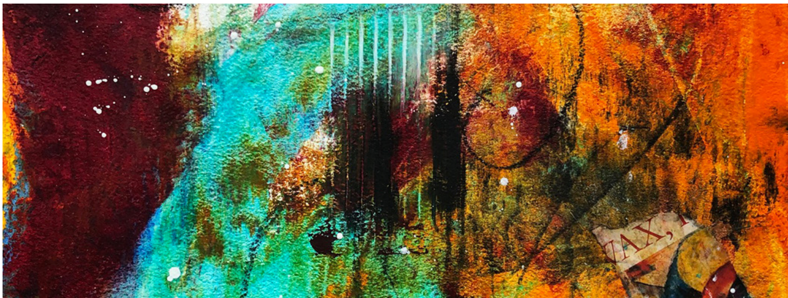
Abstract Oil Painting + Cold Wax Workshop - September 16

Our classes provide a creative space for artists to learn at every age and level.