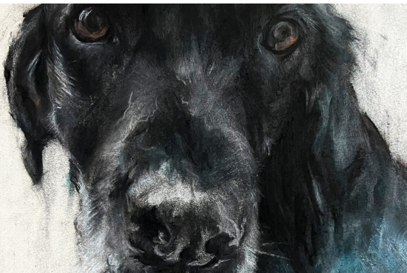
Multi-Range Drawing II - Starts February 7

Tuition is $50 for non-members / $45 for current CAC members, supplies included