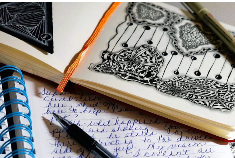
Zentangles + Writing Workshop - January 17

Our classes provide a creative space for artists to learn at every age and level.