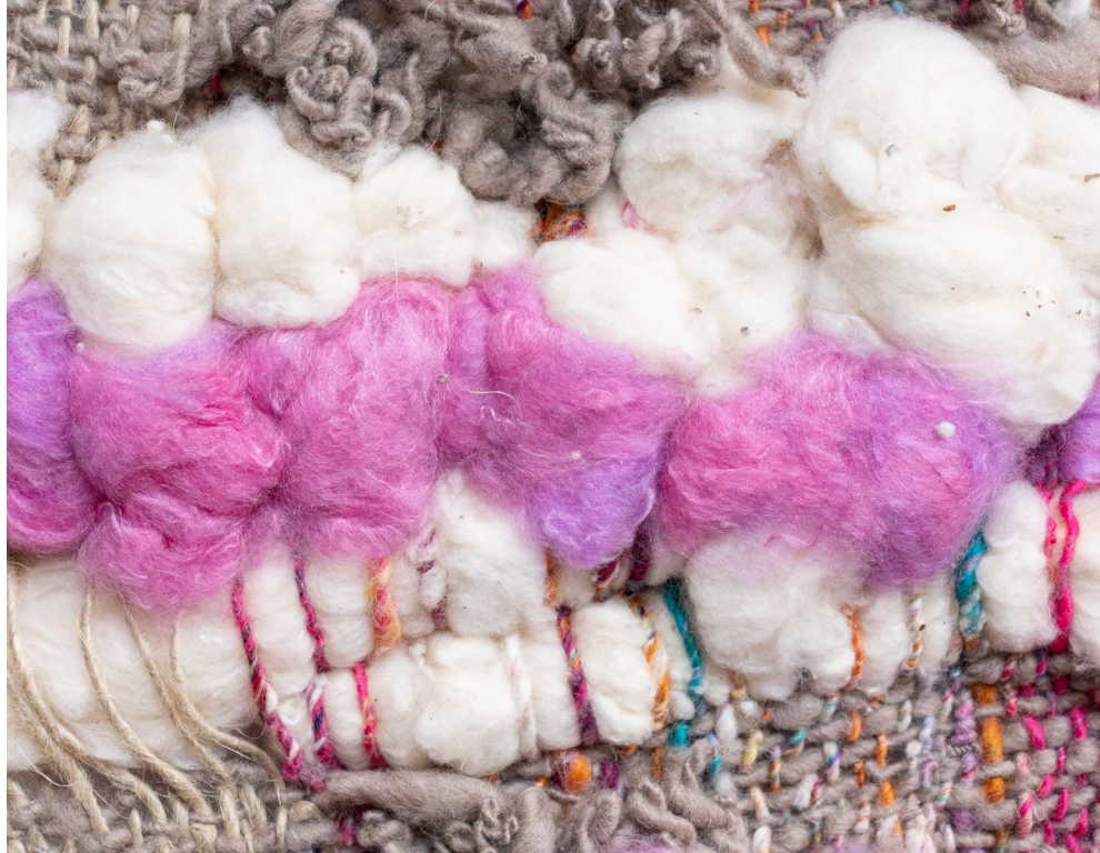
Bryana Bibbs, 7.26.20, 2020