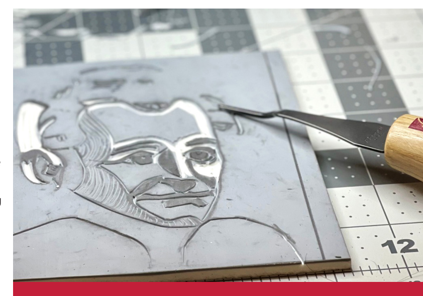
Relief Printmaking 101 - Starts January 10

Tuition is $90 for non-members / $81 for current CAC members + supply list