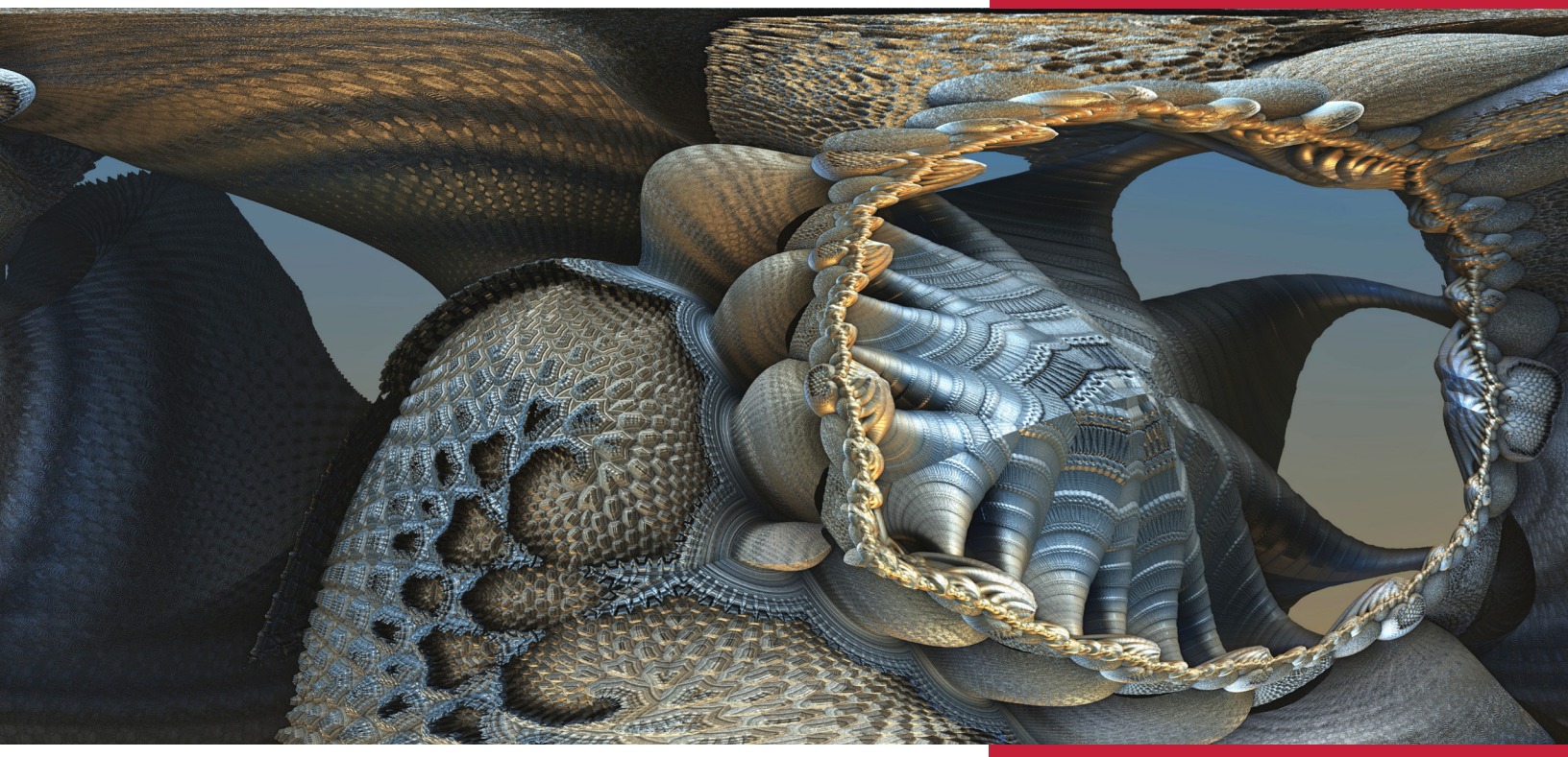
Photo: Stephanie Samaitis Carnell, 3D Blue Starfish , digital art (fractal) on metal, 24" x 36"