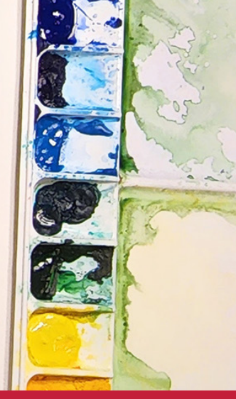
Watercolor Painting Class starts March 8

With guidance from Emily Casella, this introductory class will uncover the vast properties of contemporary colored pencils. Students will investigate different blending and stroke techniques, understand and replicate accurate color, and find joy in coloring from the world around them and from their vibrant minds. All skill levels welcome, including beginners. This class is held in the upstairs classroom.