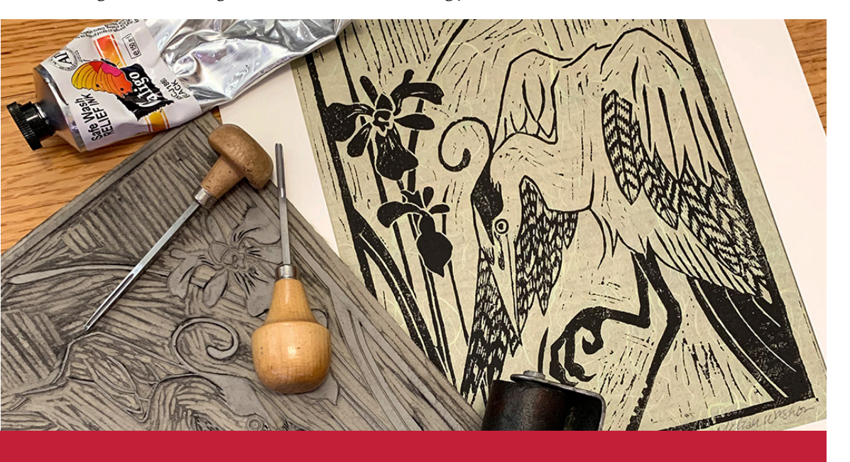
Introduction to Linocut Prntmaking starts March 7

Register today at chestertonart.org/classes.