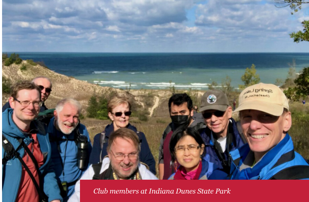
Club members at Indiana Dunes State Park