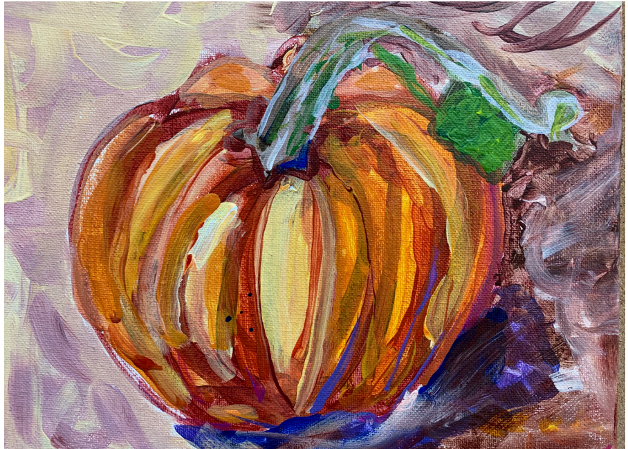
Still life painting from one of our on-site art classes

Masks are still required for on-site classes at CAC regardless of vaccination status. Visit our website for our COVID-19 guidelines. There will be no make-up days for missed classes at this time.