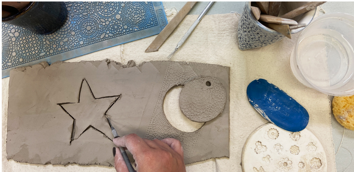
Family Fun! Ceramic Ornament Workshop

Tuition is $110 for non-members and $90 for current CAC members.