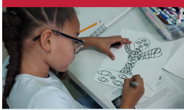
Young artist in the Portage YMCA after school art program