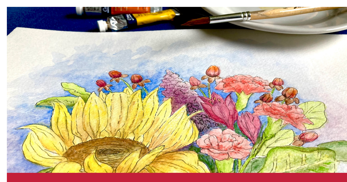
Exploring Watermedia Workshop on October 15

Tuition is $50.00 for nonmembers and $40.00 for current CAC members. All materials are provided, including glazing & firing.