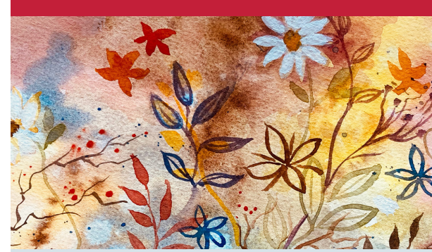
Exploring Watermedia Workshop - Starts October 28