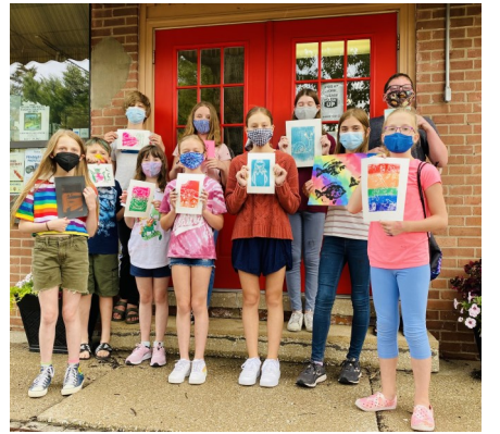
These campers learned about printmaking and made really cool prints!

Week 4: Local Animals - Ages 8 & Up - A few spots left.