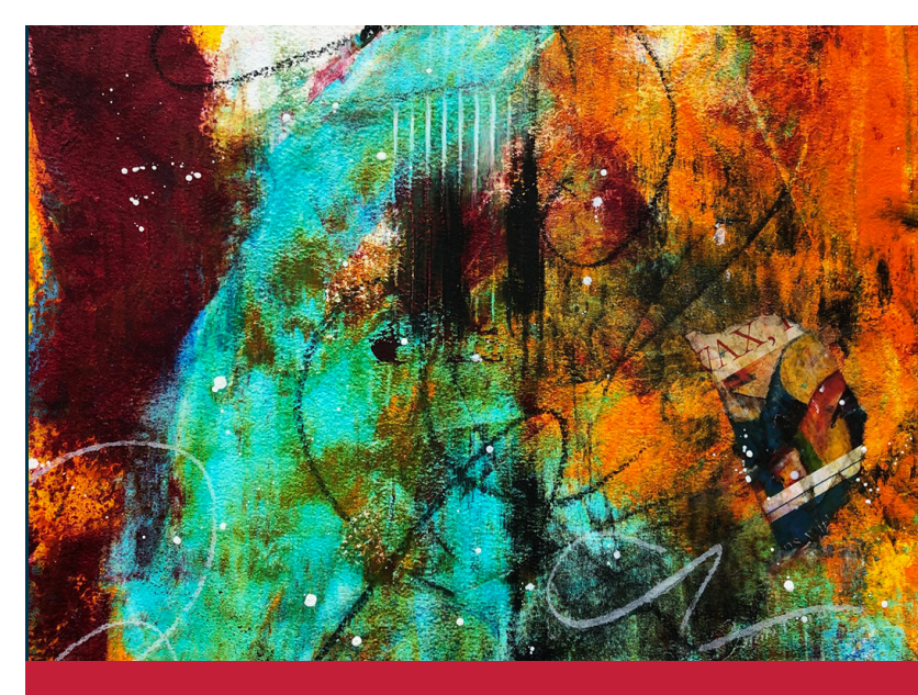
Abstract Oil Painting + Cold Wax Workshop - June 3

Tuition is $90 for non-members / $81 for current CAC members + supply list