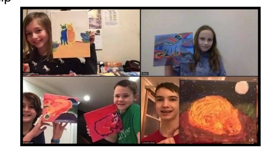
Come and Join Us in April!

Thursday 1:30-3 p.m., Ages 8-15 year-olds