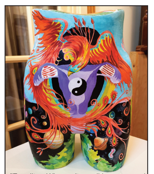
"Equality...Why can't we all be green and mingle like the trees?"

The exhibit concludes on Monday, November 9.